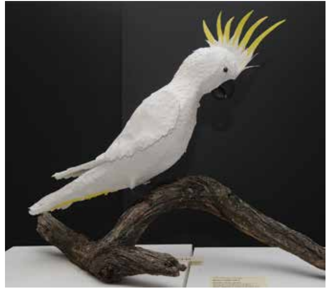
Artist: Nicole O' Regan Location: Mt David Title of work: "More than Once" – FOR SALE Category: Open 3D

Plastic bags woven into salvaged chicken wire.