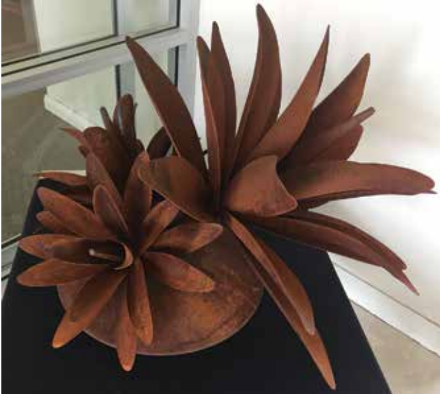
Artist: John Grady Location: Trundle Title of work: "Rustic Clutter" Category: Open 3D

Leaves are cut from sheet metal off cuts. These were placed in a mould and bent into shape, then wedged onto pieces of old pipe which was then welded on to an old plough disc.