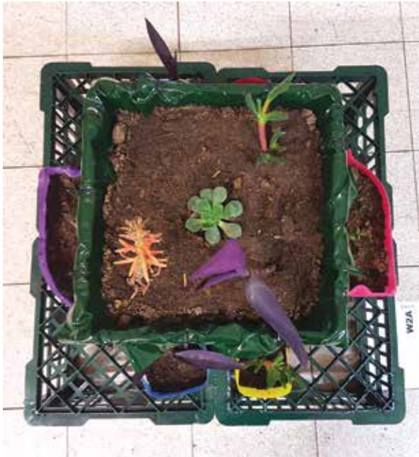
Artist: Wellbeing Centre Students Location: Coonamble Title of work: "Flower Fountain" Category: High School 3D

This garden sculpture should sit outside somewhere where the flowers and succulents can grow over and through it making it a giant plant sculpture and making use of plastic items that would otherwise have been thrown out.