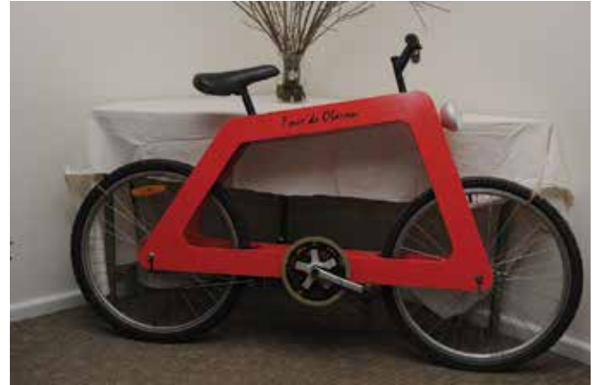
Artist: Oberon Mens Shed Location: Oberon Title of work: "I've got a Bike! You Can Ride it if You Like" FOR SALE Category: Community 3D

Made from plastic bags, milk bottles reclaimed timber. A café style table & stool set featuring recycled plastic seats & table top. The table & stool tops are made from recycled milk bottles & plastic bags, which have been melted & remoulded into a marbled pattern. The wooden legs of each item in this setting are reclaimed stool & chair legs from our local rubbish tip.