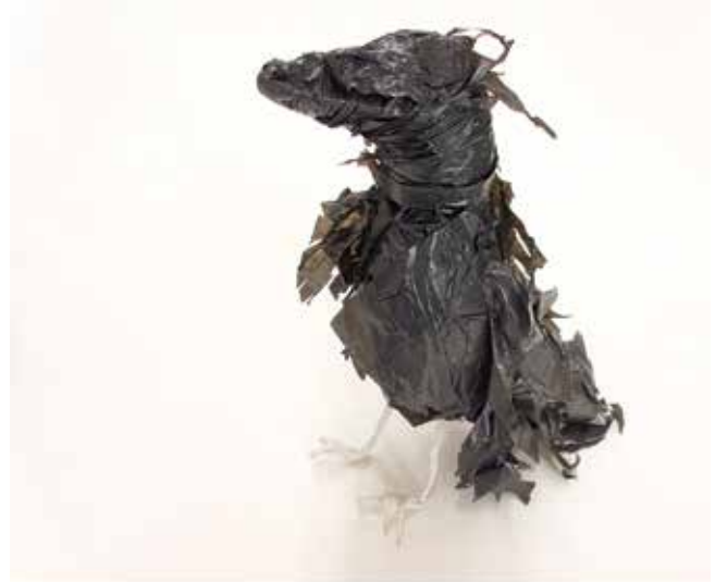
Artist: Nikola Hughes Location: Broken Hill Title of work: "Murder by Plastic" Category: Community 3D

The frame is constructed from similar palings as our old back fence where corrugated iron and wire was found everywhere. I find comfort in using the materials that make up this work.