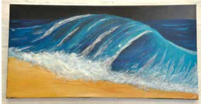
Artist: Nienke Berghuis Location: "Plastic Ocean" – FOR SALE Title of work: Mudgee Category: Open 2D

I've only been in Mudgee for less than 2 months, and during the move I realized how much stuff I carry with me. And most of this, even the clothes that we're wearing, is made out of plastic. When we wash our clothes, tiny plastic particles end up in our waterways. The artwork I've created is to raise awareness of this issue. 'Plastic Ocean' shows the ocean, which has turned into plastic, and washing all this waste onto our shores. I used acrylic paint and plastic bags from the supermarket. I actually reused the canvas; when you look closely you see raised lines from an older painting underneath.