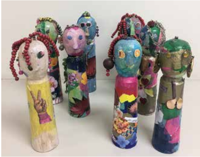
Artist: Parkes High School Location: Parkes Title of work: "Diverse Dolls" Category: High School 3D

Simple wooden peg shapes have been decorated with paper decoupage with found beads and other jewellery items by Year 10 and 11 students from the Special Education Faculty at Parkes High School. This artwork is inspired by a sense of fun and enjoyment in creating a group of characters that represent diversity and individuality in our community. Waste materials used: Found wooden peg-figure shapes, tissue paper and magazine clippings, PVA glue, old beads and chains, tacks, recycled copper wire.