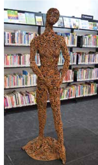
Artist: Jenny Shea Location: Orange Title: "Miriam" Community 3D

This picture is made of ironed plastic shopping bags. The image is to reflect the pollution occurring in our environment and the harm it is causing to our marine life.