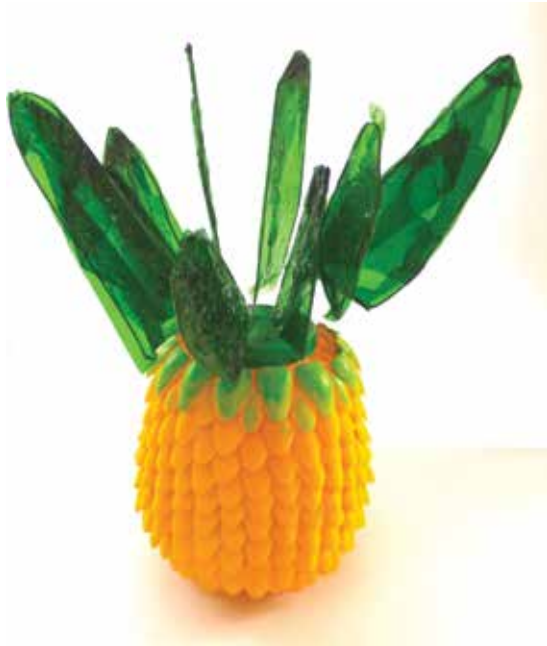
Artist: Sally Simmonds Location: Bourke Title of work: "Pineapple" Category: Community 3D

I love pineapples! So I decided to make myself a pendant light cover. I used a plastic container and covered it with plastic spoons for the main section of the pineapple. For the fronds I used wire coat hangers covered with preloved cellophane.