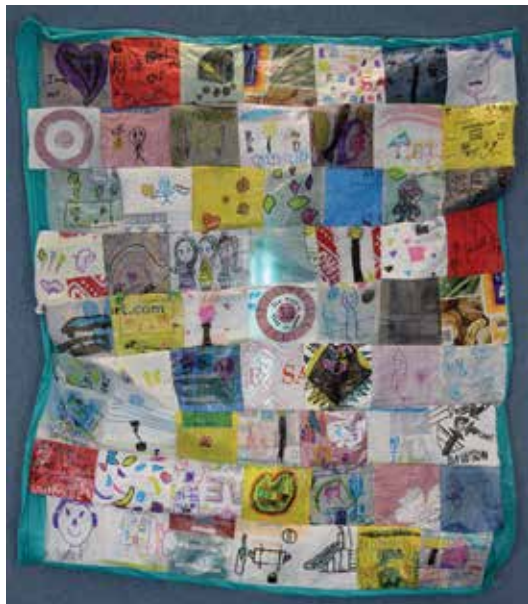
Artist: OOSH Location: Orange Title: "Plastic Bag Quilt" Primary 2D

Calare OOSH, have been focusing on the importance of 'Reduce, Reuse & Recycle'. We came up with the idea of using the plastic bags to make a quilt. Bags from the centre and home were collected to make the quilt. The children and the educator worked week to week, gluing the plastic together and ironing the plastic before drawing.