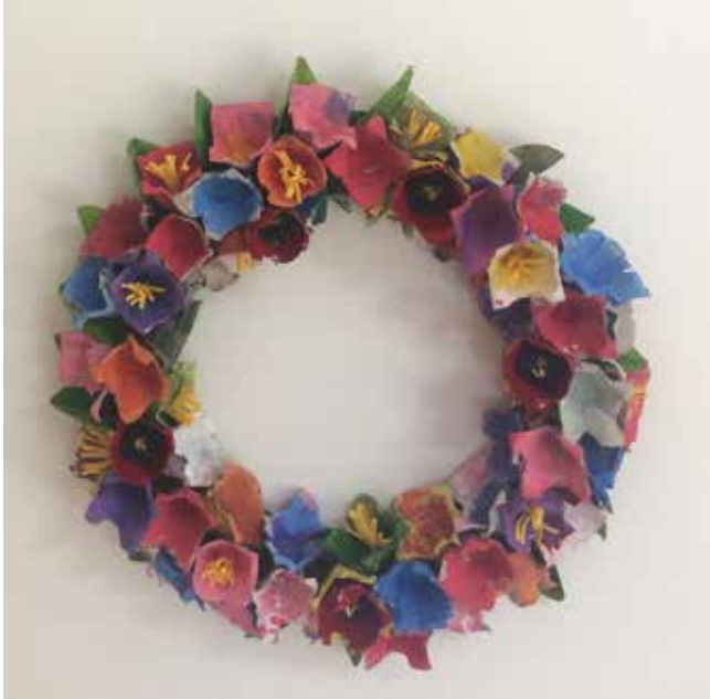
Artist: Coonamble Public School Location: Coonamble Title of work: "Anzac Wreath" Category: Primary Functional

An Anzac wreath made from egg cartons, cardboard and paper.