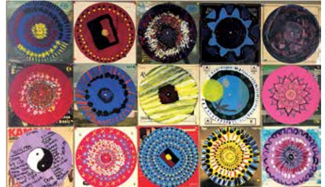
Artist: Parkes High School Location: Parkes Title of work: "LP Mandalas" Category: High School 2D

We used about 30 bottles and cut the middle of the bottle around so it made a swirl. Then we attached it to some chicken wire wrapped in a cylinder shape. We then stapled the end of all the swirly bottles to the chicken wire. We called it 'Blue Bottles' because we used blue bottles and it also looks a bit like the animal 'Blue Bottle'. Our chandelier is inspired by dale Chihuly's glass sculptures and thought the bottles would look like glass when light shines through.