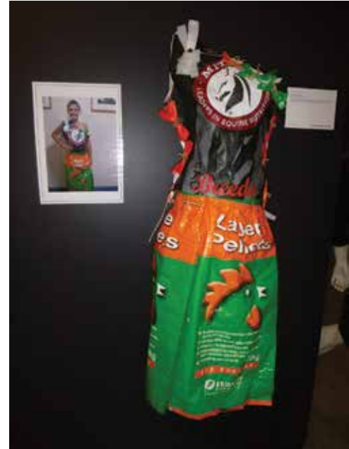
Artist: Ballimore Public School Location: Dubbo Title of work: "Plastic Fantastic" Category: Primary Functional

I followed a You-tube video describing how to make a mask from the Mortal Combat movie.