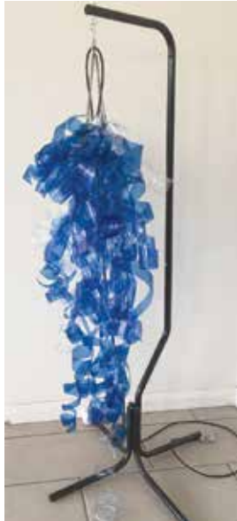
Artist: Middleton Public School 5/6H Location: Parkes Title of work: "Blue Bottles" Category: Primary Functional

We used about 30 bottles and cut the middle of the bottle around so it made a swirl. Then we attached it to some chicken wire wrapped in a cylinder shape. We then stapled the end of all the swirly bottles to the chicken wire. We called it 'Blue Bottles' because we used blue bottles and it also looks a bit like the animal 'Blue Bottle'. Our chandelier is inspired by dale Chihuly's glass sculptures and thought the bottles would look like glass when light shines through.