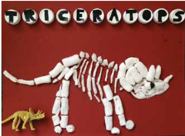
Artist: Tyson Warne Location: Bourke Title of work: "Triceratops" Category: Primary 2D

I have made the skeleton of a triceratops with packing foam. I used a fossil toy as my example to draw. I then cut out the letters from a plastic bag and glued them to plastic bottle tops.