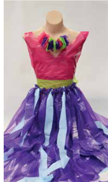
Artist: Claire Menzies, Isabelle Clarke-Randazzo, Lexi Culverson & Crystelle Googe Location: Orange Title: "AdDressing Consumer Waist" Highschool Funcional

The materials used to create this consisted of plastic bags, tape and wire. Our title relates to our artwork, as well as waste in the environment. The context behind it is that we are addressing a dress, and also outlining the consumer waste of buying excessive clothing.