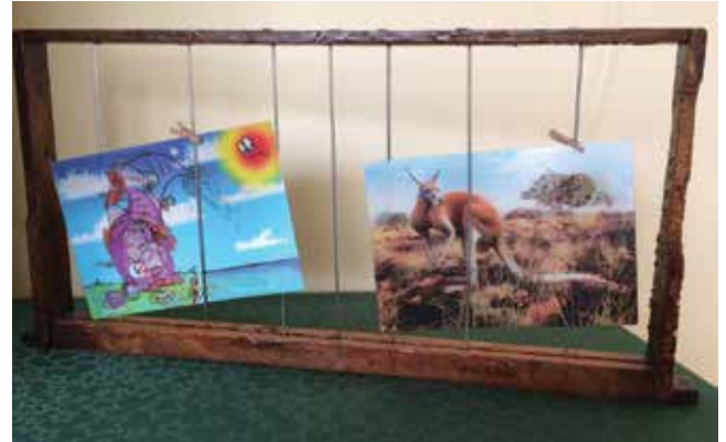
Artist: Peter Location: Bourke Title of work: "Bee Displayed" Category: Community Functional

I love pineapples! So I decided to make myself a pendant light cover. I used a plastic container and covered it with plastic spoons for the main section of the pineapple. For the fronds I used wire coat hangers covered with preloved cellophane.