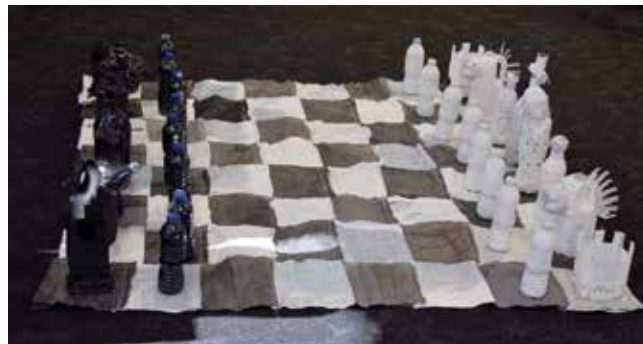
Artist: St Mary's Catholic Primary School - Year 6 Location: Orange Title: "Strategies and Choices" Primary 3D

Calare OOSH, have been focusing on the importance of 'Reduce, Reuse & Recycle'. We came up with the idea of using the plastic bags to make a quilt. Bags from the centre and home were collected to make the quilt. The children and the educator worked week to week, gluing the plastic together and ironing the plastic before drawing.