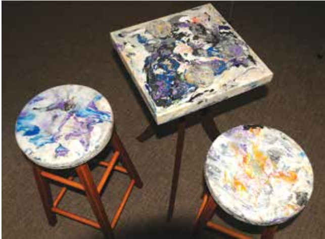
Artist: Oberon High School Visual Arts Location: Oberon Title of work: "Café Style Setting" Category: High School Functional

Made from plastic bags, milk bottles reclaimed timber. A café style table & stool set featuring recycled plastic seats & table top. The table & stool tops are made from recycled milk bottles & plastic bags, which have been melted & remoulded into a marbled pattern. The wooden legs of each item in this setting are reclaimed stool & chair legs from our local rubbish tip.