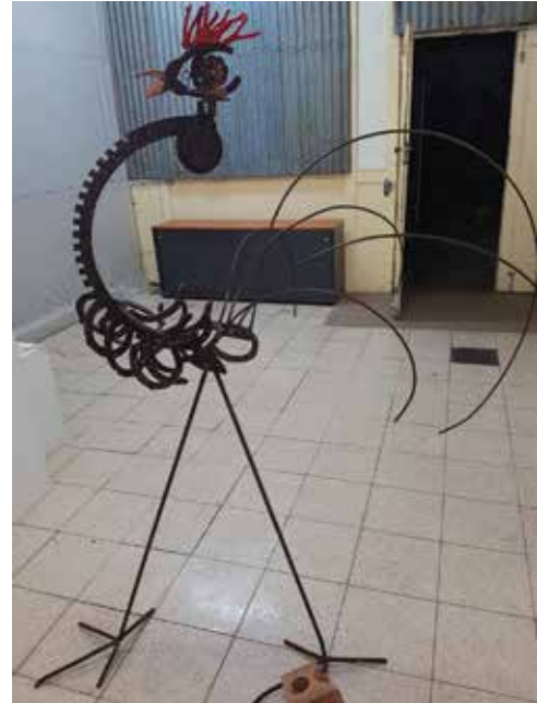
Artist: Alison Dent Location: Gulargambone Title of work: "Where is that Little Red Hen" Category: Open 3D

Why throw away plastic bags when you can wear them? Saturday night outfit sorted!