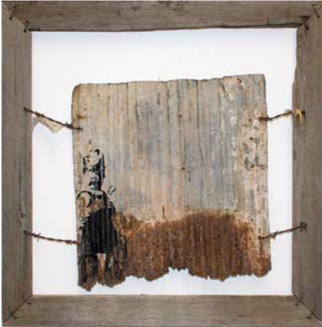
Artist: Taryn Banks Location: Broken Hill Title of work: "Shadow on a Fence" Category: Community 2D

The frame is constructed from similar palings as our old back fence where corrugated iron and wire was found everywhere. I find comfort in using the materials that make up this work.