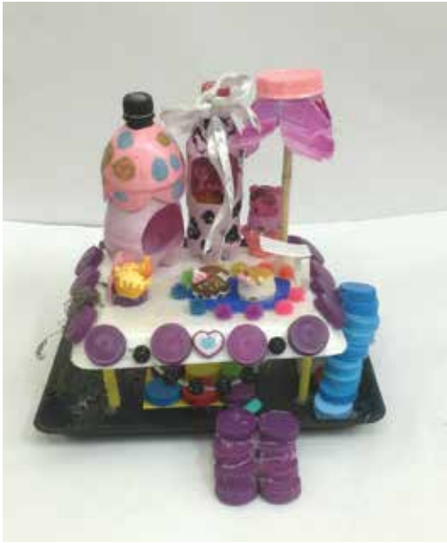
Artist: Ayla Greenscale Location: Warren Title of work: "Numnom Resort" Category: Primary 3D

Is made from all various kinds of plastic that come from the family home, including drink bottle lids, plastic containers and discarded plastic toys and repurposed to make a new toy.