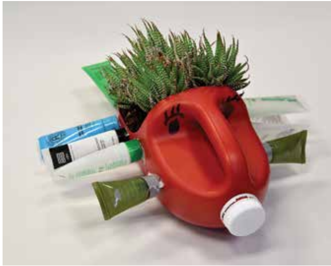
Artist: Bailey Dickson-Bubb Location: Orange Title: "Smelly Prickles" Primary Functional

I called my art work SMELLY PRICKLES. If you screw off one of the shampoo bottles and smell inside it still smells and they make good prickles. The materials I used were shampoo bottles, a tomato sauce bottle. First I tried a hot glue gun but the prickles fell off in a hour so I tried super glue but just ended up gluing myself to the body. I just tried PVA glue, blue tack and more super glue so if the prickles fall of it's the plastic in the tomato sauce bottle! My inspiration were my hobbies, I like to study animals and echidna is the subject that I'm learning and I like planting and gardening so smelly prickles is a pot plant echidna.