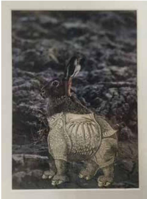
Artist: Eryn Mullins Location: Condobolin Title of work: "National Geographic" Category: Open 2D

A comment on the piles of dusty National Geographics in my shed.