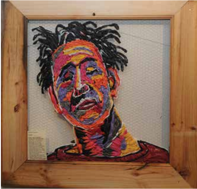
Artist: Bronwyn Ingersole Location: Oberon Title of work: "Enigma" – FOR SALE Category: Open 2D

Plastic bags woven into salvaged chicken wire.