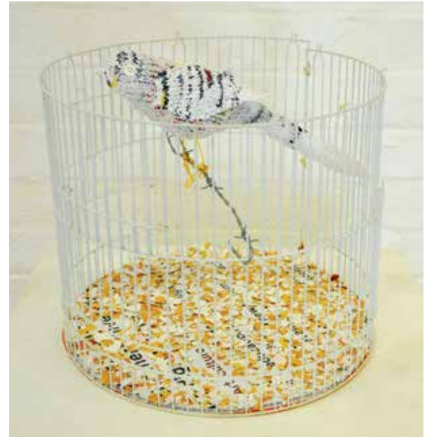
Artist: Leanne Wicks Location: Lue Title of work: "I Should Stay (I'm Sure He'll Change)" – FOR SALE Category: Open 3D

I've only been in Mudgee for less than 2 months, and during the move I realized how much stuff I carry with me. And most of this, even the clothes that we're wearing, is made out of plastic. When we wash our clothes, tiny plastic particles end up in our waterways. The artwork I've created is to raise awareness of this issue. 'Plastic Ocean' shows the ocean, which has turned into plastic, and washing all this waste onto our shores. I used acrylic paint and plastic bags from the supermarket. I actually reused the canvas; when you look closely you see raised lines from an older painting underneath.