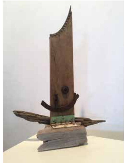
Artist: Eryn Mullins Location: Condobolin Title of work: "Float" Category: Open 3D

A comment on the piles of dusty National Geographics in my shed.