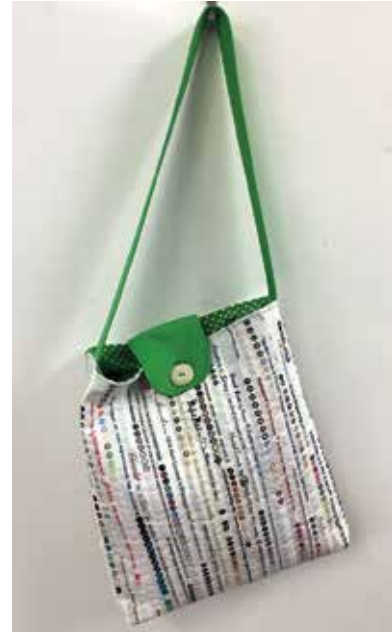
Artist: Janet O'Donoghue Location: Parkes Title of work: "Edge to Edge" Category: Community Functional

Random weave bowl made from scrap electrical cable after installation of a PV system.