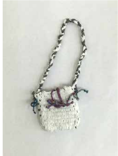
Artist: Laura Honeysett Location: Warren Title of work: "Handbag" Category: Primary Functional

Is made from all various kinds of plastic that come from the family home, including drink bottle lids, plastic containers and discarded plastic toys and repurposed to make a new toy.