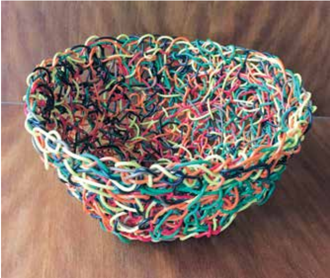
Artist: Liz MacRaid Location: Cookamidgera Title of work: "Wired" Category: Community Functional

Random weave bowl made from scrap electrical cable after installation of a PV system.