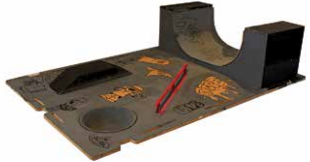
Artist: Jackson Piggott Location: Portland Title of work: "Mega Skate Park" Category: Primary 3D

The flower centres are cut from packaging out of their lunchboxes and the petals are pencil shavings from the classrooms. Ages ranging from 5 to 12.