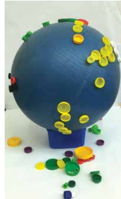
Artist: Little Skins Location: Warren Title of work: "The World is Falling Apart" Category: Community 3D

The inspiration for our painting and collage is all the pollution in our waterways. Especially after the flooding in Dubbo and rubbish floating down to Warren. Everything from fridges, plastics and products that can be seen on our painting are in our river. This affects us culturally as the river is our main source of food and our recreation i.e. swimming, boating. We found all the plastics on our painting from the Macquarie River mainly and this is only a small amount.