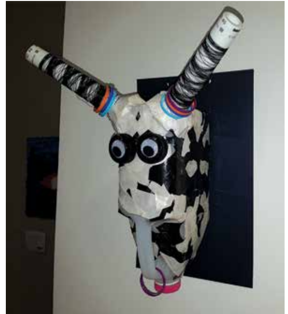
Artist: Montana Hodgson Location: Coonamble Title of work: "Red Rock" Category: Primary 3D

Created using old bottle tops and waste plastic.