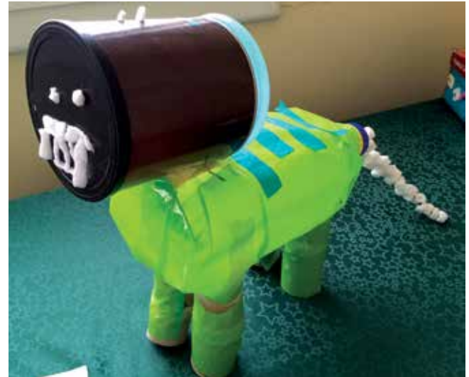
Artist: Owen Wall Location: Bourke Title of work: "Dinosaur" Category: Primary 3D

I have made the skeleton of a triceratops with packing foam. I used a fossil toy as my example to draw. I then cut out the letters from a plastic bag and glued them to plastic bottle tops.