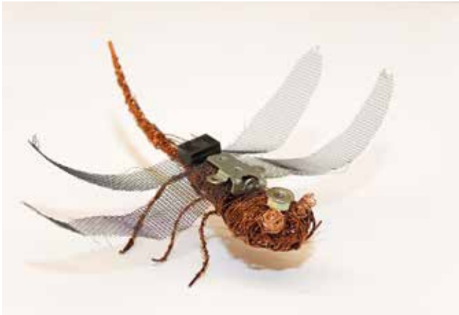
Artist: Jade Manly Location: Broken Hill Title of work: "Dragonfly" Category: Open 3D

In contemporary society, technology becomes outdated at an alarming pace. Electronic components (such as smart phones, tablets and computers) make up a large proportion of waste contributing to landfill.