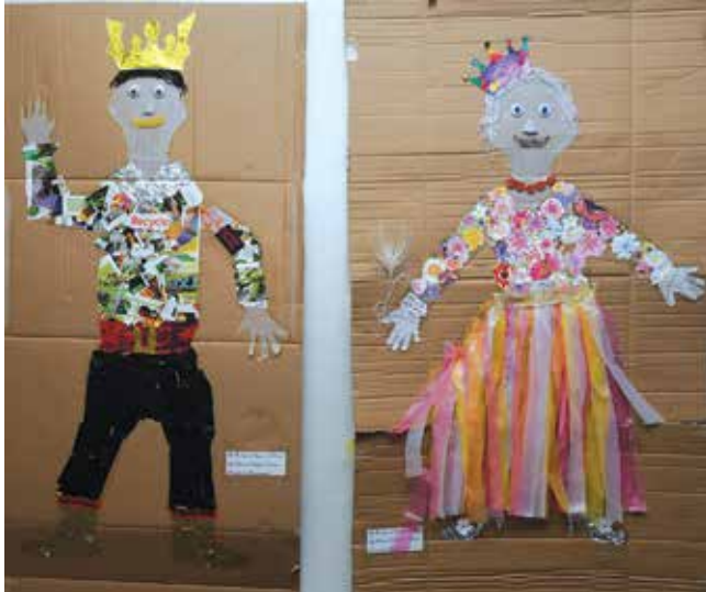
Artist: Oberon Children's Centre Location: Oberon Title of work: "King and Queen of Oberon" Category: Primary 2D

Made from a collage of mixed paper and waste.