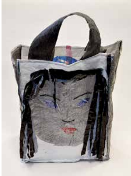
Artist: Jennie Corben Location: Orange Title: "In The Bag" Community Functional

This piece was inspired by "Reduce, Reuse, Recycle". I had a collection of plastic shopping bags at home from the times when I forgot to take my reusable shopping bags to the grocery store. I want to REDUCE the number of plastic bags I use, and I only REUSE the ones I collect for bin liners, so I decided to RECYCLE the disposable bags into reusable bags. The face on the side shows that RECYCLING can be creative and interesting as well as practical.