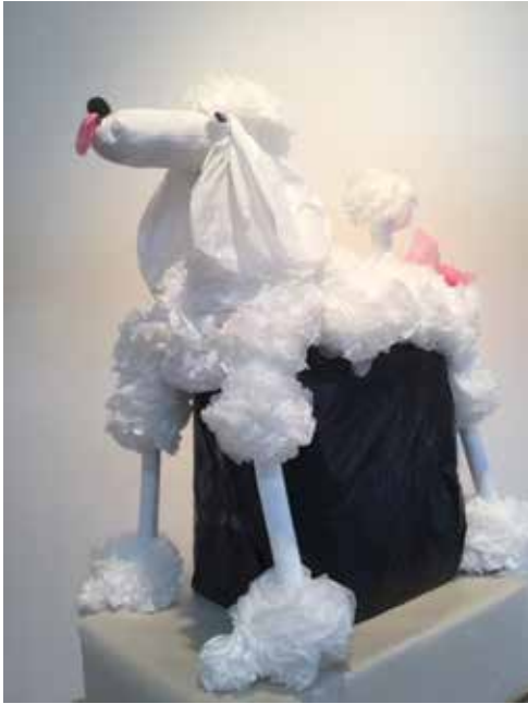
Artist: Currajong Disability Services Condobolin Location: Condobolin Title of work: "Doggy Bag" Category: Community 3D

Made from recycled shopping bags, styrofoam and a sock from St. Vincent de Paul.