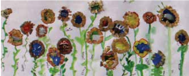
Artist: Zig Zag Public School Location: Lithgow Title of work: "Flower Garden" Category: Primary 2D

The flower centres are cut from packaging out of their lunchboxes and the petals are pencil shavings from the classrooms. Ages ranging from 5 to 12.