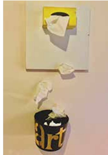
Artist: Jamie Coffill Location: Condobolin Title of work: "Waste to Art" Category: Community 2D

A practical idea for home use while enjoying hot drinks.