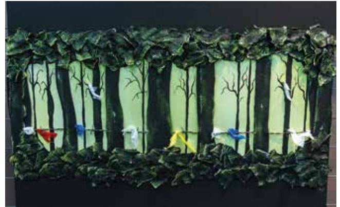
Artist: Will Hazzard Location: Meadow Flat Title of work: "Bird on a Wire" – FOR SALE Category: High School 2D

The children first started practising on boards with plastic supermarket bags however when it came to our final product we chose to use coloured bags. The educators assisted the children however the project was very much a child led process. We collaborated as a group on ideas of how to attach our final pieces together and what we could use the final weaving for. It was decided to revamp our classroom lamp. Thus began a process of stitching and connecting. The educators are very proud of how focussed and motivated the children were during this project.