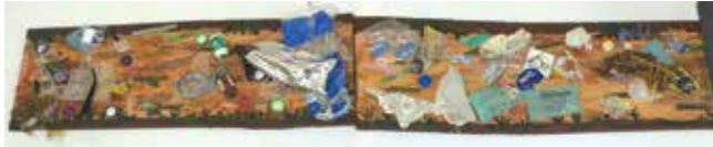
Artist: Little Skins Location: Warren Title of work: "Macquarie River" Category: Community 2D

The inspiration for our painting and collage is all the pollution in our waterways. Especially after the flooding in Dubbo and rubbish floating down to Warren. Everything from fridges, plastics and products that can be seen on our painting are in our river. This affects us culturally as the river is our main source of food and our recreation i.e. swimming, boating. We found all the plastics on our painting from the Macquarie River mainly and this is only a small amount.