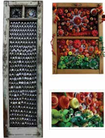
Artist: Clare McAdam Location: Lithgow Title of work: "Rain - Shine - Grow" Category: Community 2D

I have been entering Waste To Art since I was 5 years old. This year I decided to use plastic bags also, as they were the suggested material for 2017 Waste To Art. It was fun plaiting the bags together. Plastic Bags cause a lot of damage to our environment, especially to creatures like Sea Turtles who think that floating plastic bags are delicious jellyfish. There are even big islands of plastic rubbish called Gyres which are polluting our oceans.