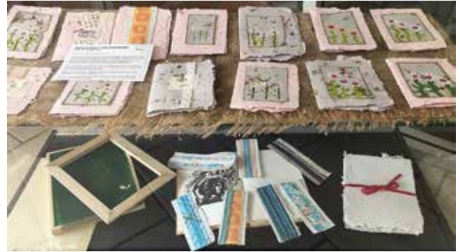
Artist: Parkes High School Location: Parkes Title of work: "Handmade Paper" Category: High School Functional

Simple wooden peg shapes have been decorated with paper decoupage with found beads and other jewellery items by Year 10 and 11 students from the Special Education Faculty at Parkes High School. This artwork is inspired by a sense of fun and enjoyment in creating a group of characters that represent diversity and individuality in our community. Waste materials used: Found wooden peg-figure shapes, tissue paper and magazine clippings, PVA glue, old beads and chains, tacks, recycled copper wire.