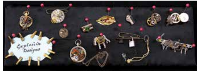
Artist: Fiona Grove Location: Lithgow Title of work: "Explosive Designs" – FOR SALE Category: Community Functional

These lovely little flowers were made from the bases of sprite and water pet bottles. All of the stems are made from recycled products and the box vase was once a fence paling. Sprites hide in the garden under your flowers. Hence the title of the work.