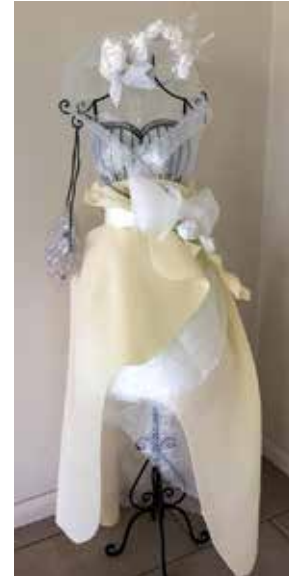
Artist: Margaret Marshall Location: Parkes Title of work: "Haute Couture Gown" Category: Open Functional

Leaves are cut from sheet metal off cuts. These were placed in a mould and bent into shape, then wedged onto pieces of old pipe which was then welded on to an old plough disc.