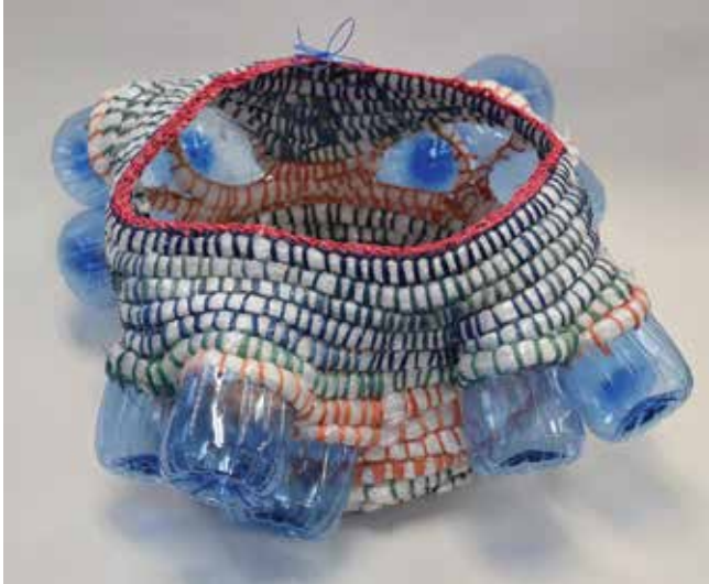
Artist: Hawa Wright Location: Orange Title: "Baskets" Open 3D

My baskets are made with plastic wraps plastic drinking bottles and raffias this is to show what you could make with what people throw away.