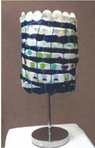
Artist: Scallywags Childcare Centre Location: Bathurst Title of work: "Weave Magic" Category: Primary Functional

The children first started practising on boards with plastic supermarket bags however when it came to our final product we chose to use coloured bags. The educators assisted the children however the project was very much a child led process. We collaborated as a group on ideas of how to attach our final pieces together and what we could use the final weaving for. It was decided to revamp our classroom lamp. Thus began a process of stitching and connecting. The educators are very proud of how focussed and motivated the children were during this project.