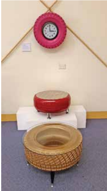
Artist: Elaine Colbeck Location: Broken Hill Title of work: "The Wheels Go Round..." Category: Community Functional

Tyres are accumulating in landfill, they take a very long time to breakdown. Why not turn them into something else?