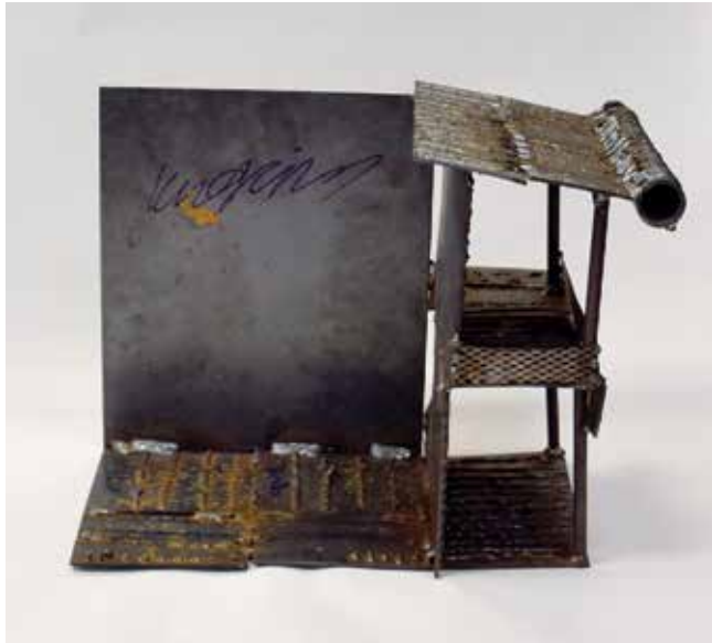
Artist: Charlie Thurgate Location: Orange Title: "Ettamogah Pub" Highschool 3D