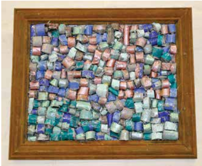
Artist: Lifeskills Plus Inc. Location: Mudgee Title of work: "Plastic Pointillism" Category: Community 3D

Lifeskills clients rolled and glued plastic bags onto straws into bead shapes and cut to size. They were then painted with nail polish and glued to form their impression of a pointillist painting in soft blues, pinks and aquas.