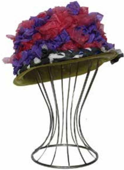
Artist: Dia MacNamara Location: Clarence Title of work: "Plastic Bag Hat" Category: Primary Functional

I have been entering Waste To Art since I was 5 years old. This year I decided to use plastic bags also, as they were the suggested material for 2017 Waste To Art. It was fun plaiting the bags together. Plastic Bags cause a lot of damage to our environment, especially to creatures like Sea Turtles who think that floating plastic bags are delicious jellyfish. There are even big islands of plastic rubbish called Gyres which are polluting our oceans.