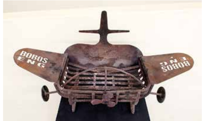
Artist: Graham Banks Location: Broken Hill Title of work: "Fire Up" Category: Open Functional

In contemporary society, technology becomes outdated at an alarming pace. Electronic components (such as smart phones, tablets and computers) make up a large proportion of waste contributing to landfill.