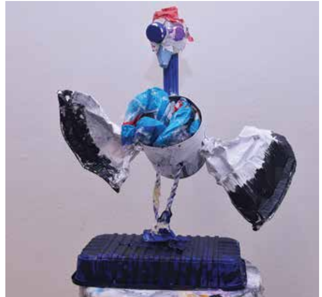
Artist: Pip Webb Location: O'Connell Title of work: "Crane" Category: Primary 3D

Made from a collage of mixed paper and waste.