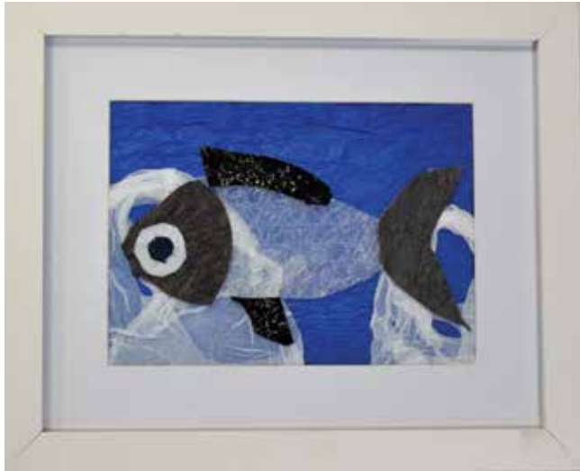
Artist: Fiona Cooper Location: Orange Title: "Frustrated Fish" Community 2D

This picture is made of ironed plastic shopping bags. The image is to reflect the pollution occurring in our environment and the harm it is causing to our marine life.