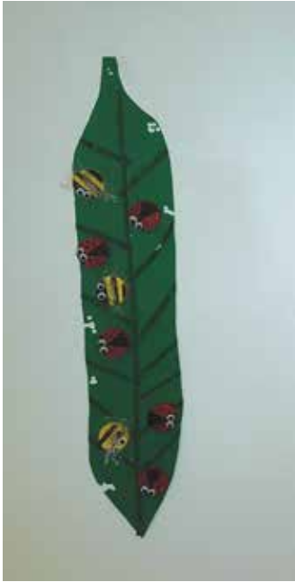
Artist: Felicity Fagan Location: Coonamble Title of work: "City of Bugs" Category: Primary 2D

Created using old bottle tops and waste plastic.