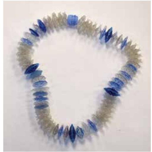
Artist: Renee Thorley Location: Orange Title: "Take Back The Tap Lei" Open Functional

My baskets are made with plastic wraps plastic drinking bottles and raffias this is to show what you could make with what people throw away.