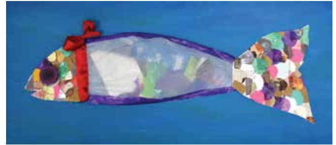
Sascha Duffy & Erin Franks Location: Orange Title: "You Are What You Eat" Highschool 2D

I called my art work SMELLY PRICKLES. If you screw off one of the shampoo bottles and smell inside it still smells and they make good prickles. The materials I used were shampoo bottles, a tomato sauce bottle. First I tried a hot glue gun but the prickles fell off in a hour so I tried super glue but just ended up gluing myself to the body. I just tried PVA glue, blue tack and more super glue so if the prickles fall of it's the plastic in the tomato sauce bottle! My inspiration were my hobbies, I like to study animals and echidna is the subject that I'm learning and I like planting and gardening so smelly prickles is a pot plant echidna.