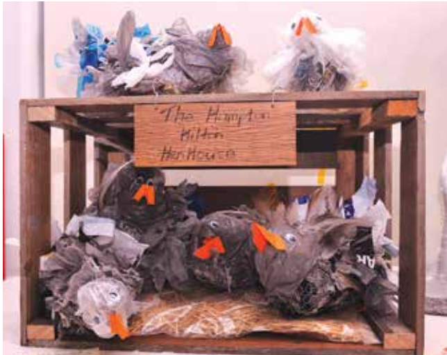
Artist: Hampton Public School Location: Oberon Title of work: "The Hilton Henhouse" Category: Primary 3D

The Hilton Henhouse is the home for our chickens at our School. We have six chickens in the Hilton Henhouse, one for each of us, as there are only six students in our School. We all raised these chickens together, right from eggs in an incubator earlier this year. We loved watching them hatch, and then we all worked hard to keep them warm with a heat lamp and fed lots of yummy feed. This Waste to Art entry is a representation of our chickens, and how much we love them. The chickens are made with wire mesh, and plastic bags. This small version of the Hilton Henhouse is made with wood.