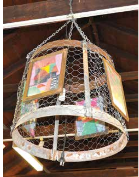
Artist: Lifeskills Plus Inc. Location: Mudgee Title of work: "Patch of Light" - FOR SALE Category: Community Functional

Lifeskills clients rolled and glued plastic bags onto straws into bead shapes and cut to size. They were then painted with nail polish and glued to form their impression of a pointillist painting in soft blues, pinks and aquas.