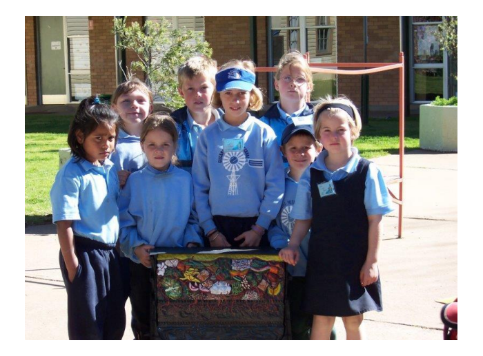
Partnership Project G: Working with Schools in LGAs not covered by the NetWaste Contract

As indicated in the NetWaste Regional Programs Model above, NetWaste will continue to work with schools in Councils who do not have the services of a waste contractor who delivers education. In order to be cost, and more particularly, outcome effective, work will occur where there are spin-off benefits from the program. These include; teacher professional development, training for Council staff in how to deliver schools programs etc.